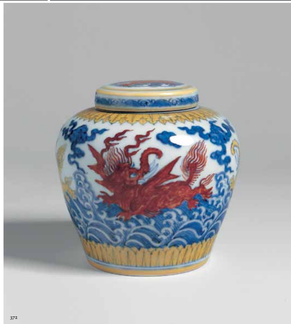
pl. 372 Doucai porcelain 'Tian' jar Ming Dynasty, Chenghua period (1465–87) height 11.1 cm Private collection