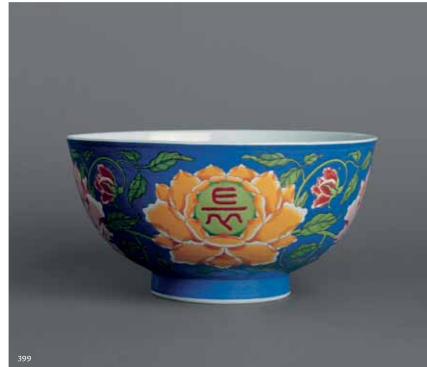
pl. 399 Blue-ground famille-rose porcelain bowl with flower decoration Qing Dynasty, Kangxi yuzhi mark and period (1662–1722) diameter 14.5 cm Private collection