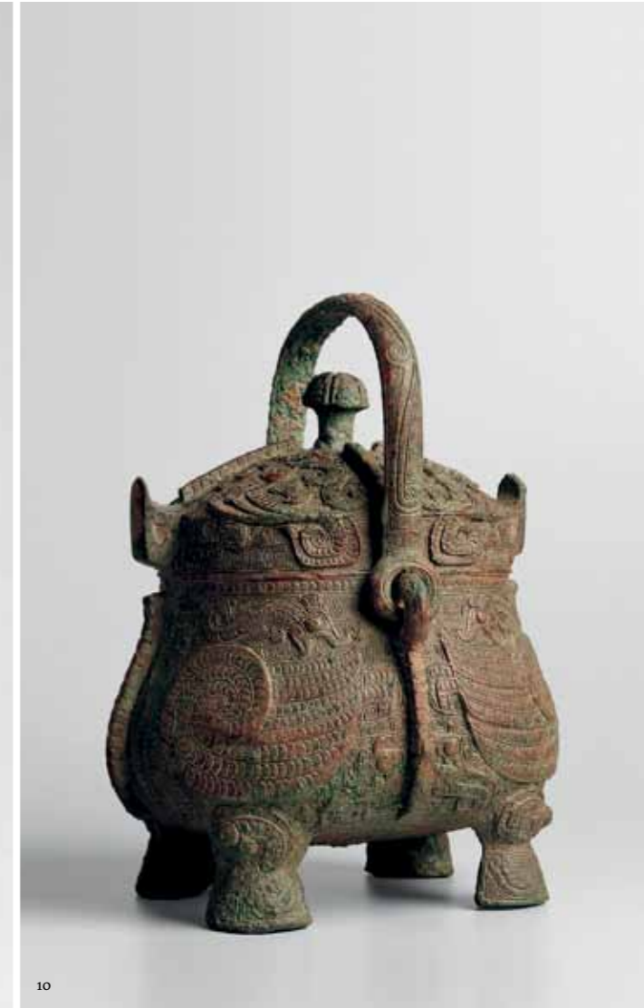
pl. 10 Archaic bronze you Shang period, 11th century BC height 17.2 cm Meiyintang collection